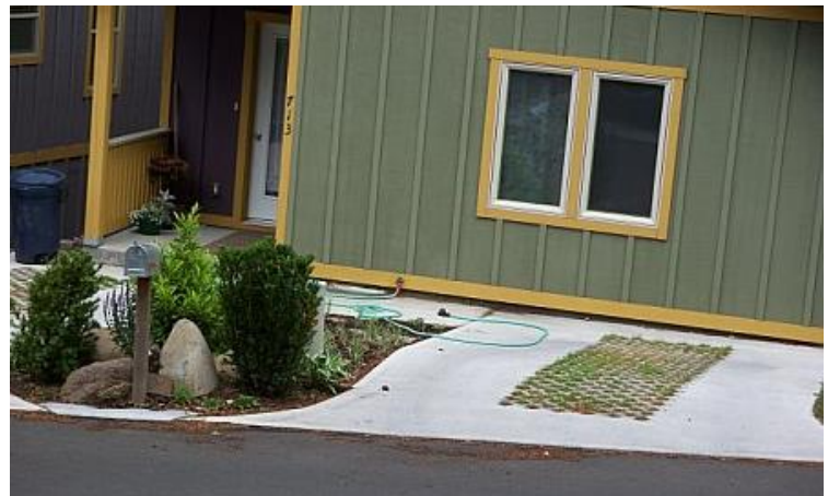
Green driveways and rain gardens are attractive ways of reducing stormwater runoff.